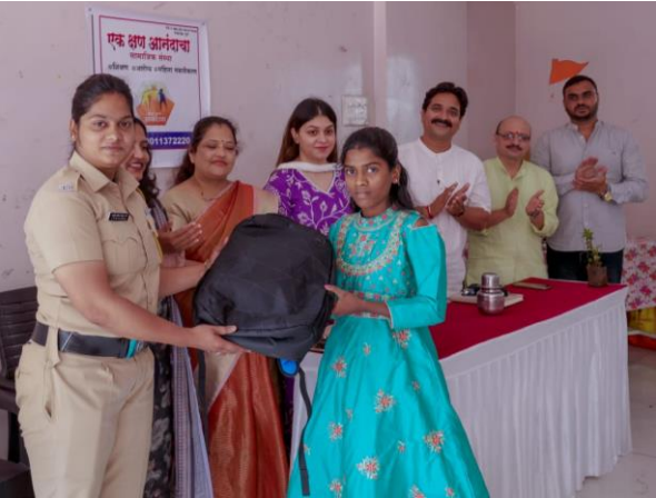
Educational kit preparation