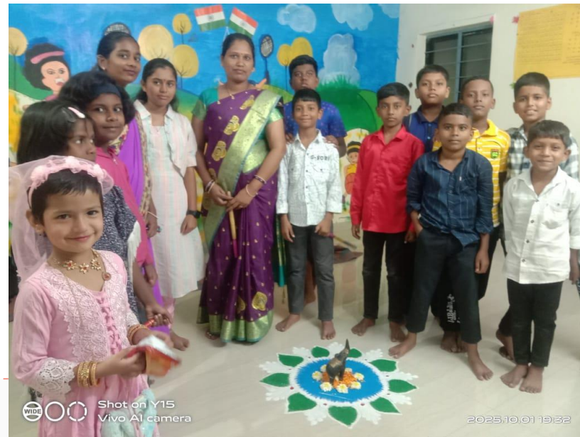
Rakhi Poornima celebration