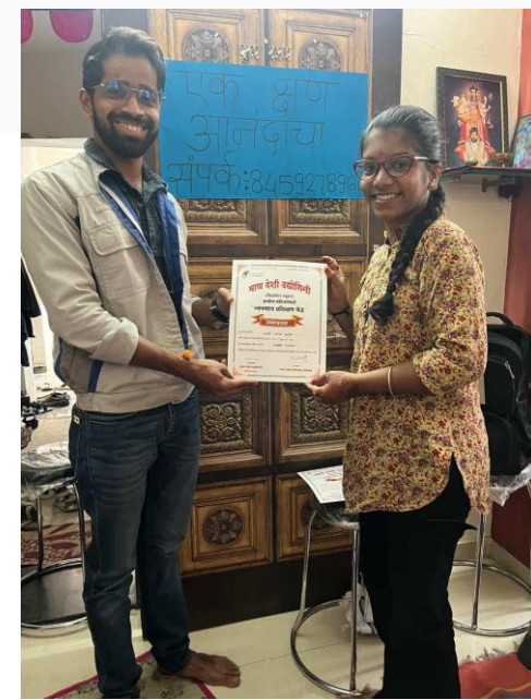
Financial Awareness Training